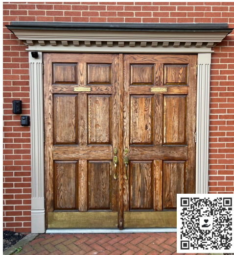
Pictured above is the front door to the clock tower that has seen better days.