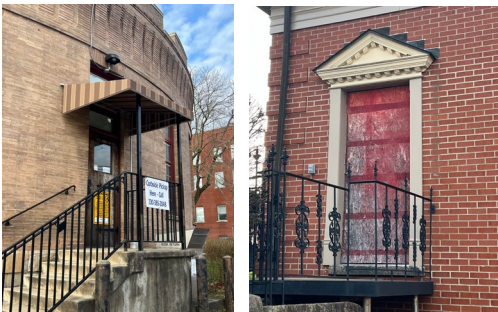
Left: The new awning at the Carnegie Library compared to the side door at the clock tower that needs restored.