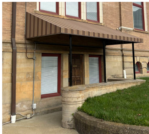
Pictured above is the new awning above the door at Carnegie Library. This is what we would like to have installed over the doors at the Alumni building.