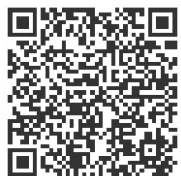
UPDATE YOUR INFORMATION

Use your phone camera to scan these codes and access links.